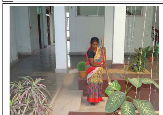
Weeding out old records and basic cleanliness works

AICRP on Home Science Unit, College of Community Science, Tura, Meghalaya- Pledge taking on 16 December, 2018