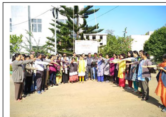
Pledge Taking at College of Community Science, Tura, Meghalaya

AICRP on Home Science Unit, College of Community Science, Tura, Meghalaya- Pledge taking on 16 December, 2018