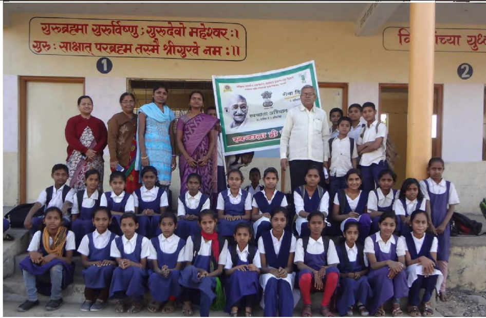
Participants of rangoli competition at Sayala village