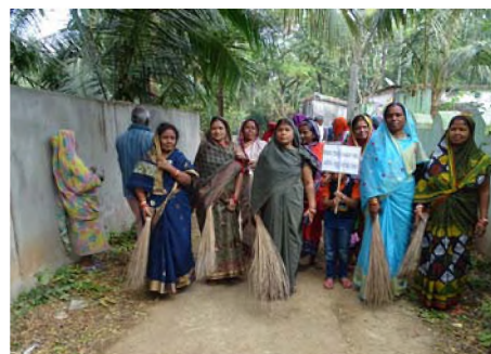
Swachhta Programmes at Village Khandagarh in Cuttack district