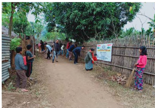
Cleanliness works at MGMG villages, Tura, Meghalaya