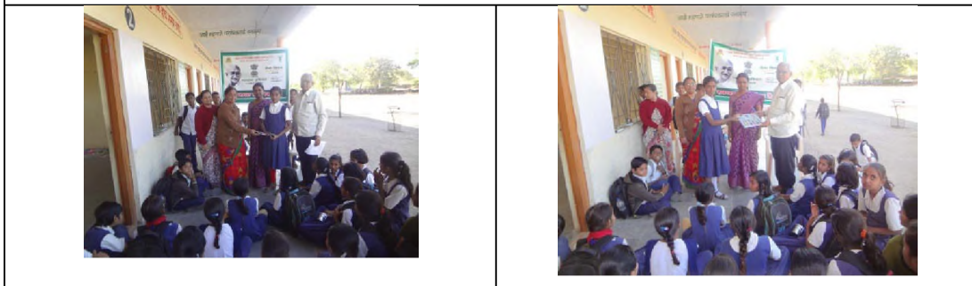
Prize distribution of rangoli competition