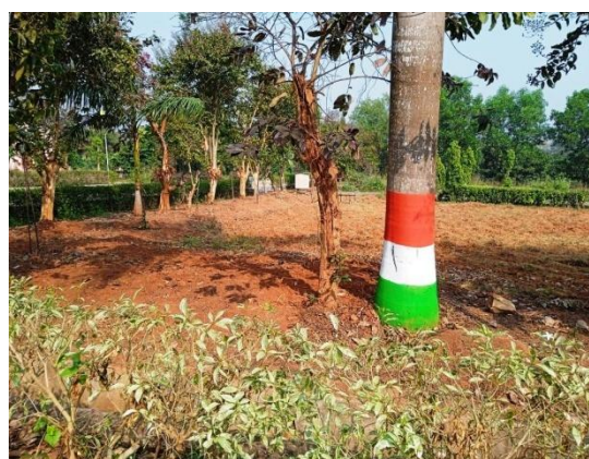
Cleanliness drive in Office premises