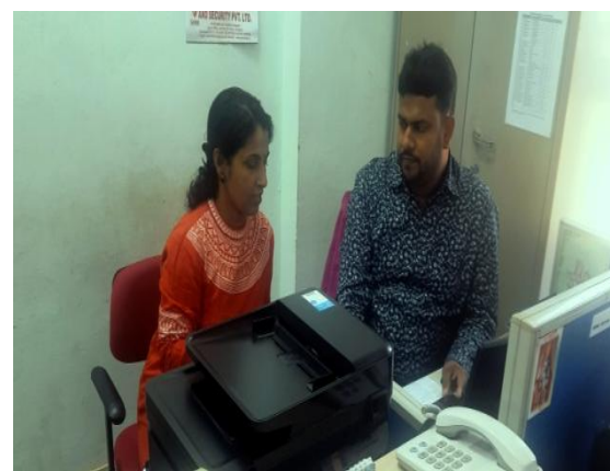
Stock taking on weeding out of old records and digitalization of office