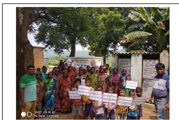
Awareness on use of toilets

On 17 th September, 2018, an off-campus programme was carried out in Village Bounshaput in Khordha Dist. The programme started with awareness creation on hygiene and sanitation, around better sanitation practices like using a toilet, hand washing, health and hygiene awareness. etc. followed by discussion among farm women on Swachhta theme. Cleaning of streets, drains and back alleys were carried out. Door-to-door meetings were also conducted to drive behaviour change with respect to sanitation behaviours. Awareness creation on use of toilets and pit-digging exercises were also carried out. Further, planting materials were also distributed among the farm women for creating a cleaner and greener environment.