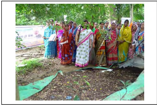
Mobilizing community to build compost pits