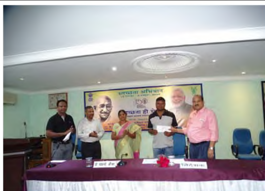
Distribution of prizes to the winners of competitions