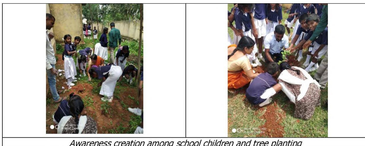
Awareness creation among school children and tree planting

In commemoration with "Swachh Bharath Abhiyan", AICRP-Food and Nutrition Unit, UAS, GKVK, Bengaluru organised a one day programme at adopted village Lakshmidivipura in Doddaballapura taluk. An awareness programme on "personal and environmental hygiene and sanitation" was conducted for school children. Further, the school premises were cleaned, fruits saplings were planted in the school compound and seeds were also distributed to initiate nutrition kitchen garden which can be used in mid-day meal programme. The school children also took the oath in regional language for the upkeep of environmental and personal hygiene and sanitation.