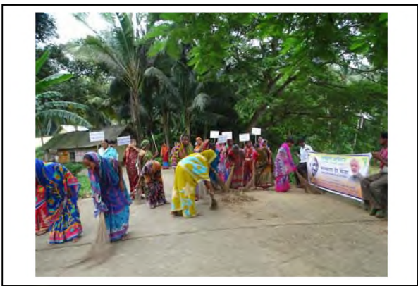
Cleaning of streets