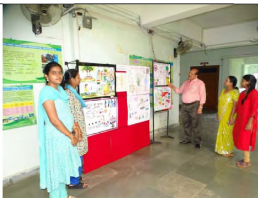
Poster competition on the theme ' Swachh Bharat Swasth Bharat '