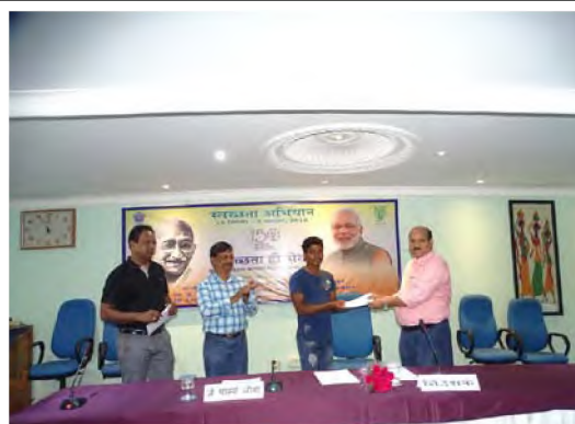
Felicitation of housekeeping staff