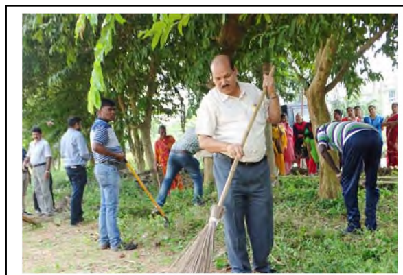
Shram Daan by staff