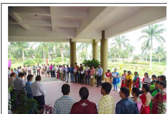
Formation of human chain