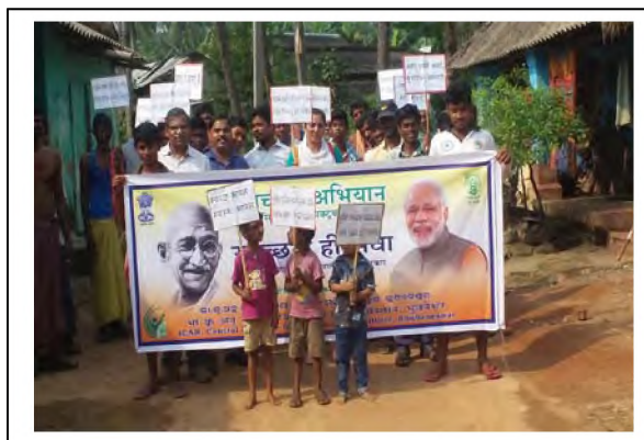
Village level rally

collection drives in households and common or shared spaces and prompt disposal of wastes were also demonstrated. The community was mobilized to build compost pits, where organic matter decomposes to form manure. Awareness creation on use of toilets and pit-digging exercises for vermicomposting were also carried out. Further, fodder planting materials were also distributed among the farm families for better health of livestock. About 40 farm families participated in the programme. Further, during an on-campus programme, sharam daan and cleanliness activities were also carried out in the area/ plot earmarked for each staff in CIWA premises.