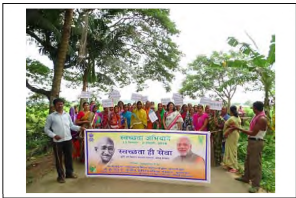
Village level rally for awareness creation

As part of the ongoing "Swachhta Hi Sewa" campaign, an off-campus cleanliness drive was carried out in Village Nuasahi in Puri district on 28 th September, 2018. The programme started with a village level rally for awareness creation on hygiene and sanitation, around better sanitation practices like using a toilet, hand washing, health and hygiene awareness. etc. followed by discussion among farm women on Swachhta theme. Cleaning of streets, drains and back alleys were carried out. Door-to-door meetings were also conducted to drive behaviour change with respect to sanitation behaviours. Awareness creation on use of toilets and mobilization of community for building compost pits were also carried out. Further, planting materials were also distributed among the farm women for creating a cleaner and greener environment. About 60 farm women participated in the programme.