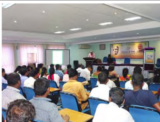
Mahatma Gandhi Birth Anniversary address by Director