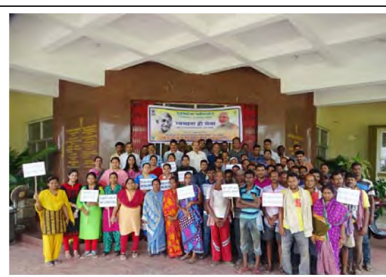
Participants of the campaign