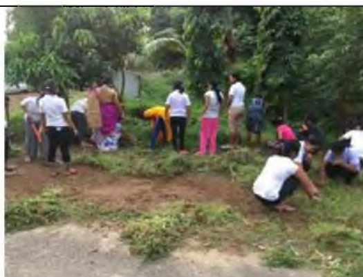
Shram Daan by AICRP Scientists and Students at Tura