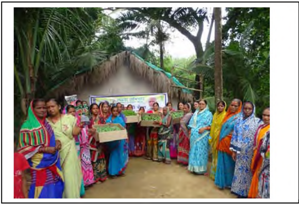
Distribution of planting materials