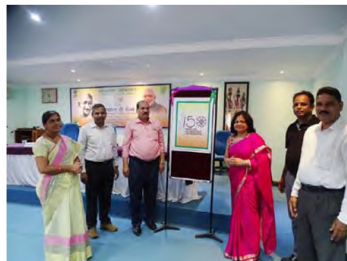
Unveiling of logo of 150 th Birth Anniversary of Mahatma Gandhi