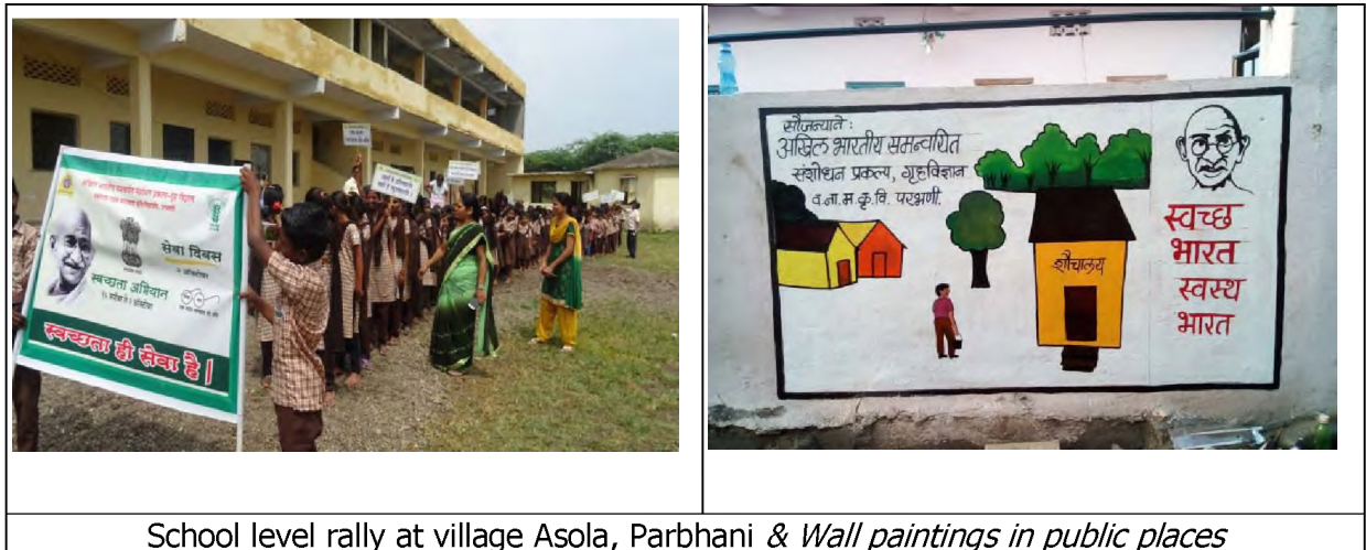
School level rally at village Asola, Parbhani & Wall paintings in public places