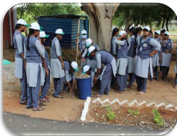
Separation of biodegradable plant wastes for composting

The Community Science College and Research Institute, Tamil Nadu Agricultural University, Madurai carried out a cleaning drive in the Institute. On this occasion, the Dean, AICRP Scientists, Teaching & Non-Teaching Staff, AICRP Research Fellows, UG and PG Students actively participated in the cleaning drive of the campus and surrounding areas. Weeds, waste papers, polythene covers, plastic and glass bottles were removed from the campus and surrounding premises such as roads, lawns, vehicle parking areas and drains etc. Subsequently the collected wastes were separated into two categories such as biodegradable and non-biodegradable wastes for easy and effective way of waste disposal and its management. Also the biodegradable wastes were put into composting.