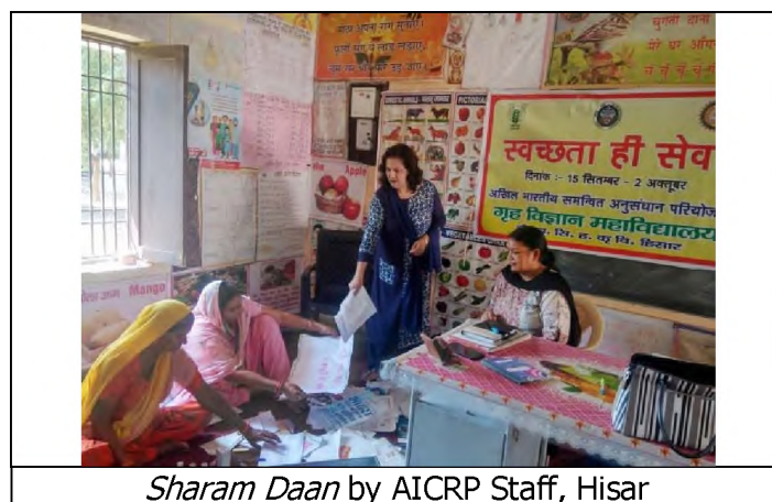
Sharam Daan by AICRP Staff, Hisar