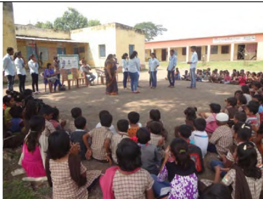
Performing Swachhta related street plays at village Katneshwar, Parbhani