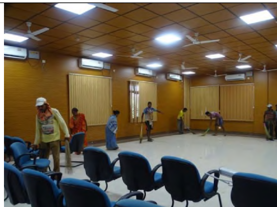
Shram Daan at ICAR-CIWA premises