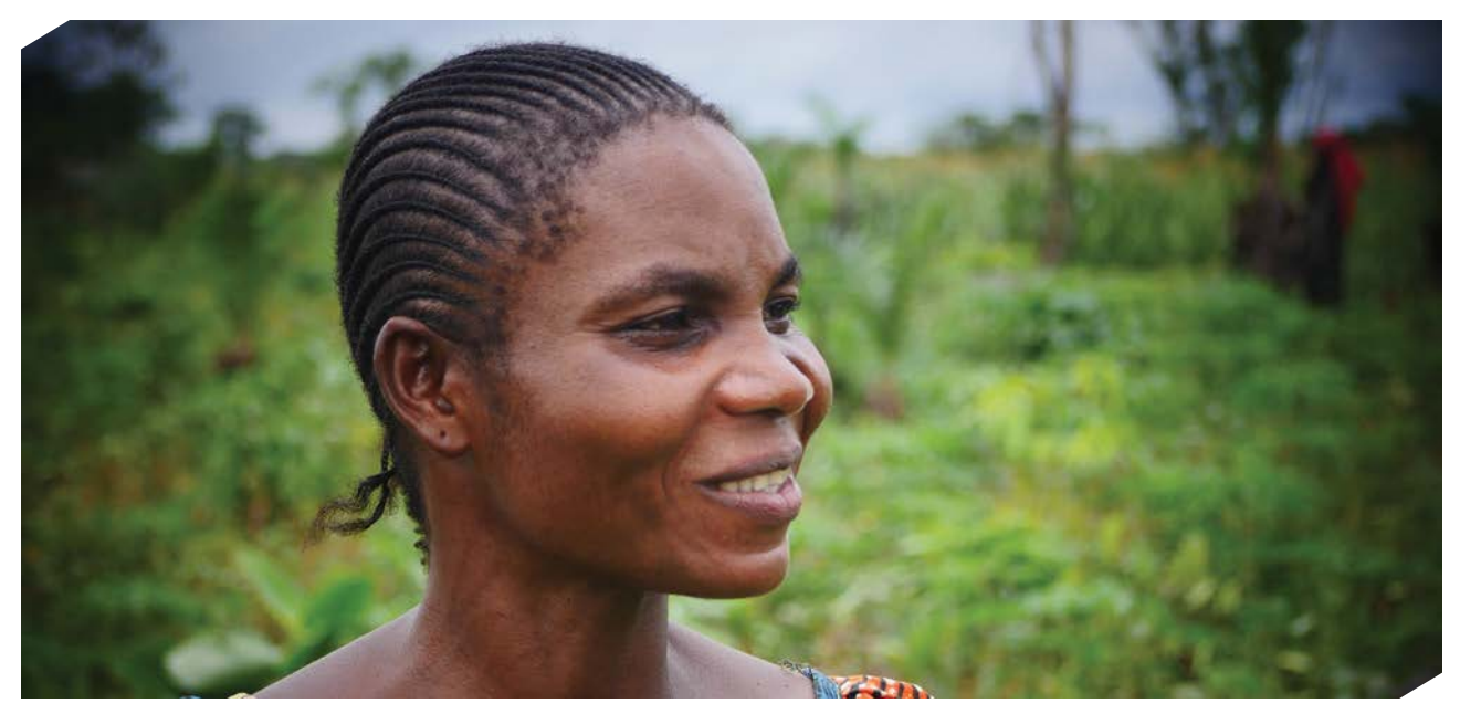
DR Congo - Tshopo Province (Lilanda Village). This woman is a producer and a Dimitra Club member. The Clubs, working with the local Union of producers' organizations, have identified adapted crop varieties and successfully tested new techniques.