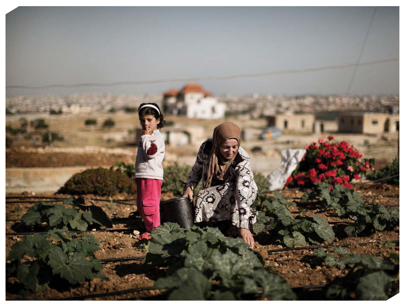
West Bank and Gaza Strip - Yatta. A Palestinian farmer tending her backyard garden.

Vulnerability to shocks and crises is closely linked with gender inequality: disasters reinforce, perpetuate and increase gender inequality. Moreover, women's contributions to resilience building and peace processes are often overlooked and their potential for leadership is not yet fully recognized.